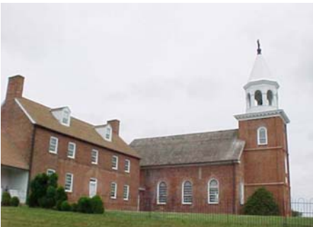
The Old Bohemia Church-St. Francis Xavier Shrine near Warwick, Maryland.