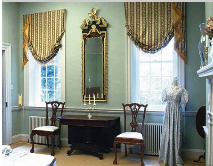
Period furniture and clothing at Marietta.