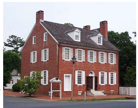
The Brick Hotel, Odessa, Delaware.

Members with energy to burn after touring Odessa might enjoy exploring nearby Chesapeake City, Maryland, the home of the busiest canal in the nation. The town's historic area is on the National Historic Registry as well as Maryland's His-